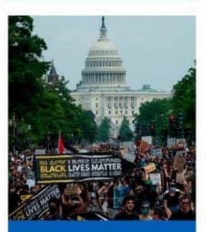
Project 3: Stop Police Violence