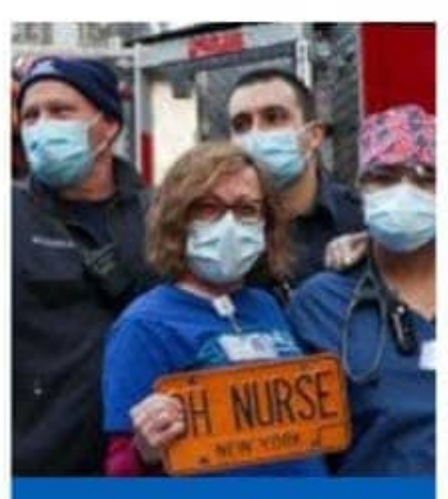
Project 2: Stop the Pandemic