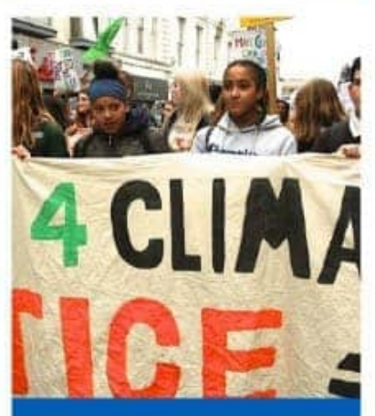
Project 4: Stop Global Warming